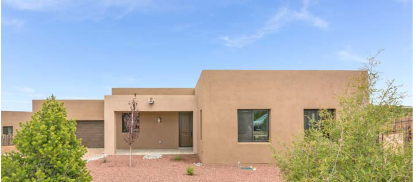
Contemporary elevation shown. Photo may reflect upgrades. Garage placement may vary. See back side for full disclosures.